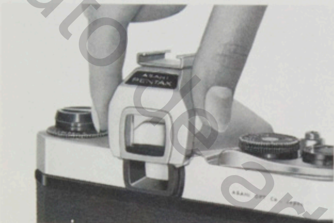
When using any Pentax model other than the Spotmatic II, attach the Accessory Clip II to the viewfinder frame of the camera. Then mount the Super-Lite II onto the Accessory Clip II.