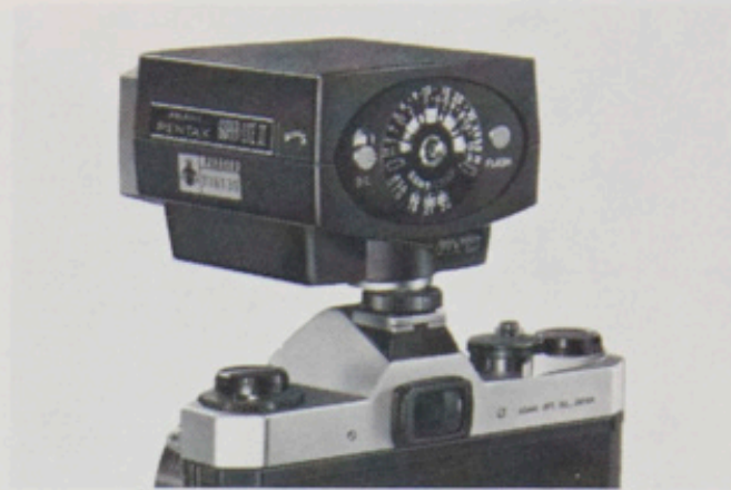
Mount the Super-Lite II onto the hot shoe of your Spotmatic II.