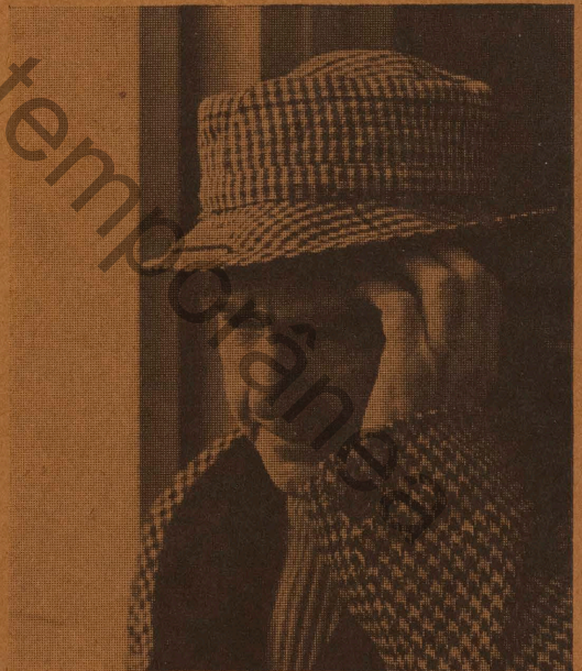
Henry Moore: photographed by Crispin Eurich

Detail of figure by Henry Moore photograph by Crispin Eurich