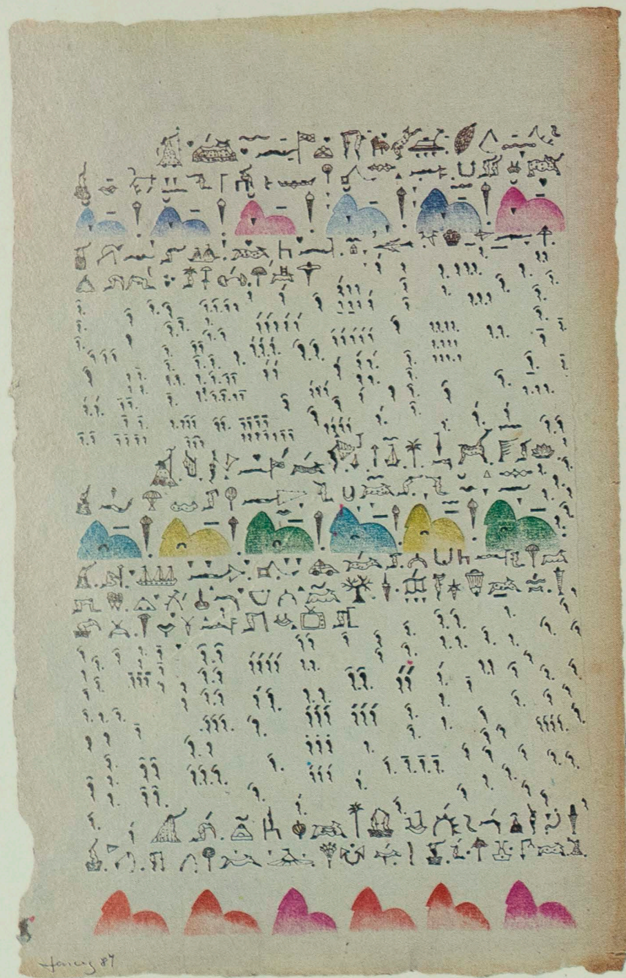
Cover: Legendary Writings of Rio , 1987 Pen and ink with colored pencil 9 × 12 inches